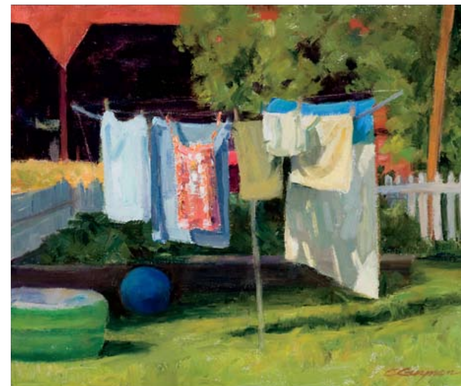
Backyard Bliss Oil on Linen | 2007