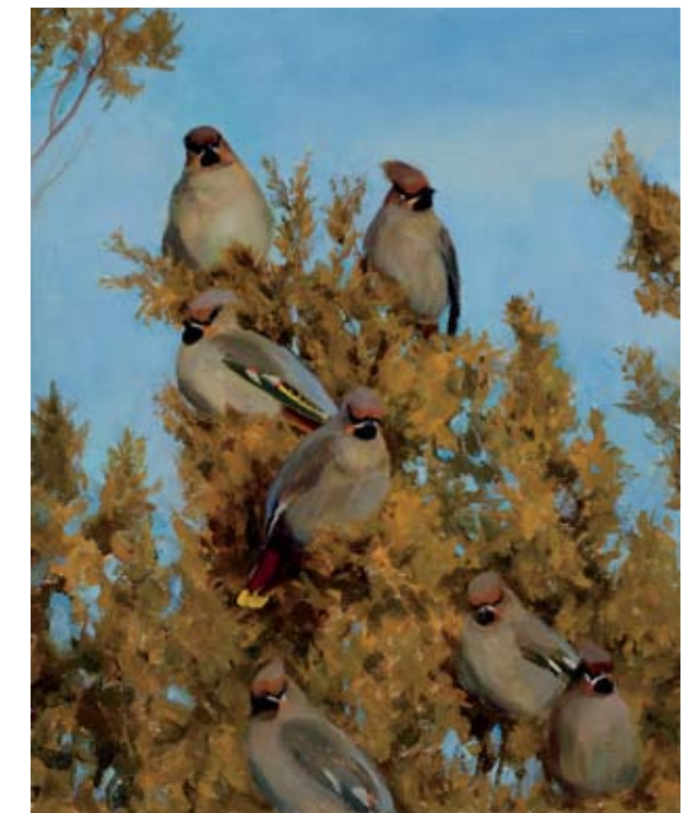
Waxwings in Junipers Oil on Linen | 2008