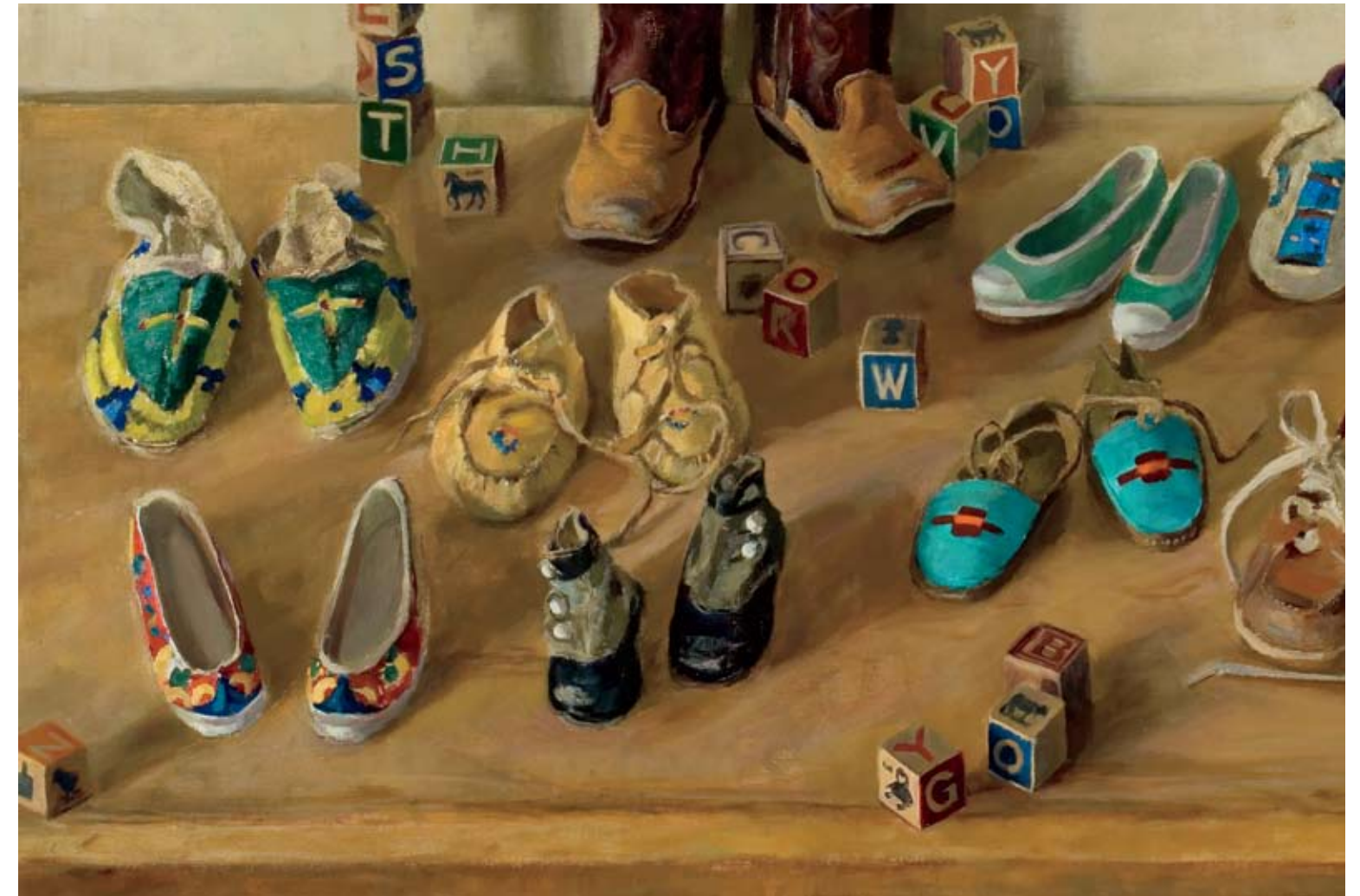
Boots and Blocks Oil on Linen | 2007